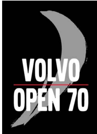
Diagram 2: Negative Variant on dark background