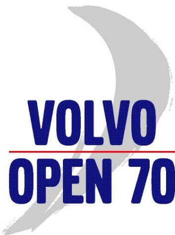
Diagram 1: Positive variant on a light background